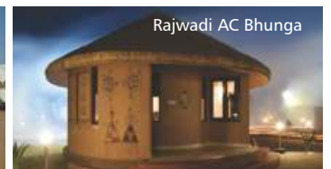
Rajwadi AC Bhunga